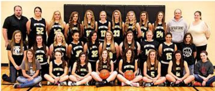
Girls basketball picture.