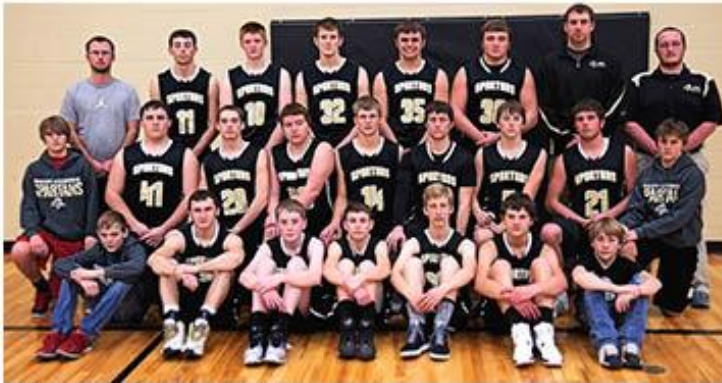
Boys basketball picture.