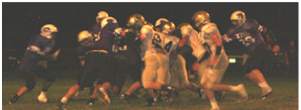
Ansley Litchfield Spartans vs. Axtell Wildcats