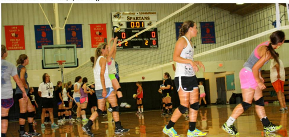
Volleyball girls working hard at practice.