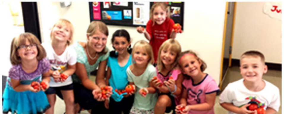
First grade showing the tomatoes from garden.