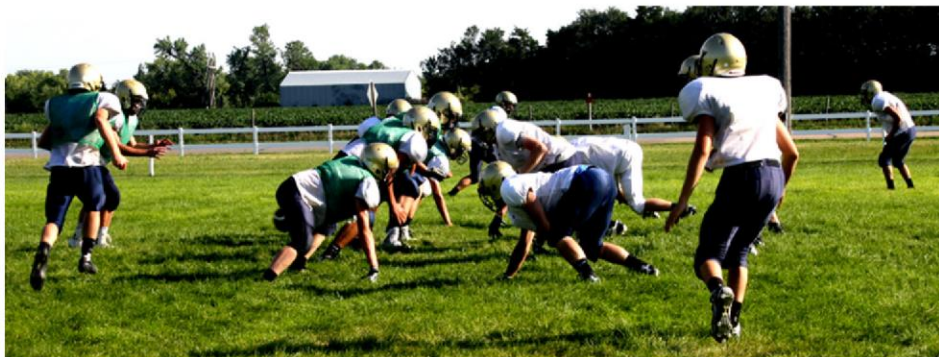
Spartan football players practice hard to get ready for games